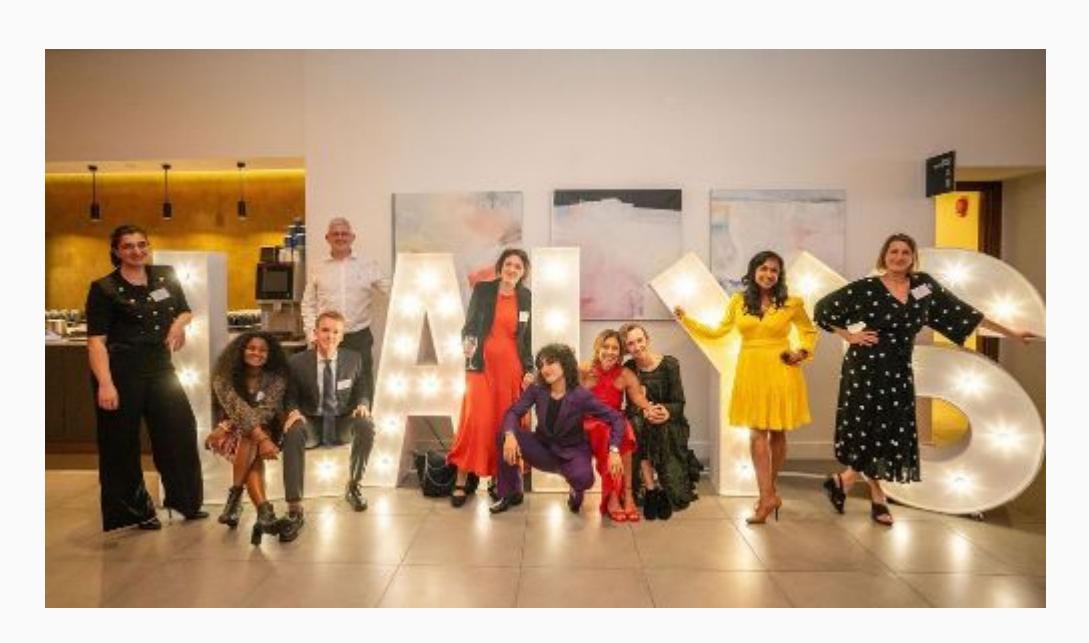
Copyright © 2025 Legal Aid Practitioners Group, All rights reserved.

Want to change how you receive these emails? You can <u>update your preferences</u> or <u>unsubscribe from this list</u>.