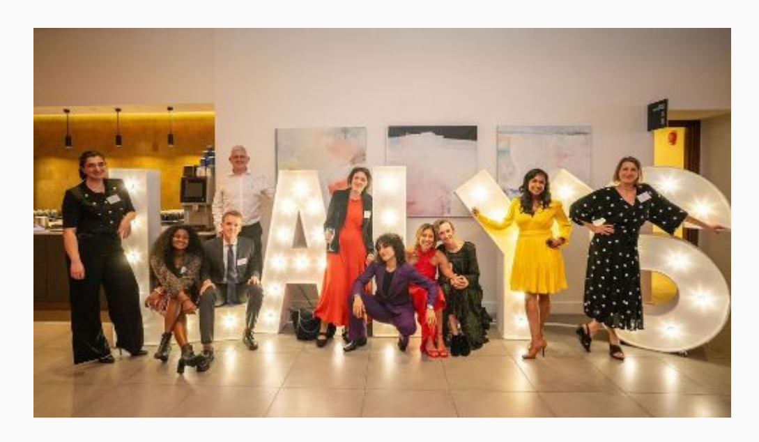
Copyright © 2025 Legal Aid Practitioners Group, All rights reserved.

Want to change how you receive these emails? You can <u>update your preferences</u> or <u>unsubscribe from this list</u>.