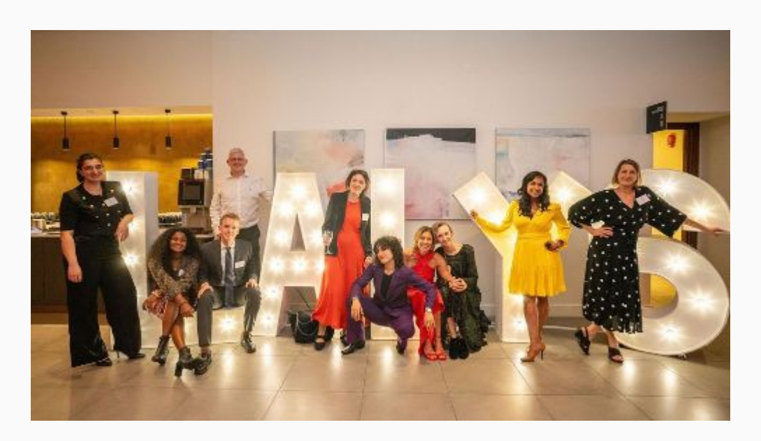
Copyright © 2025 Legal Aid Practitioners Group, All rights reserved.

Want to change how you receive these emails? You can <u>update your preferences</u> or <u>unsubscribe from this list</u>.