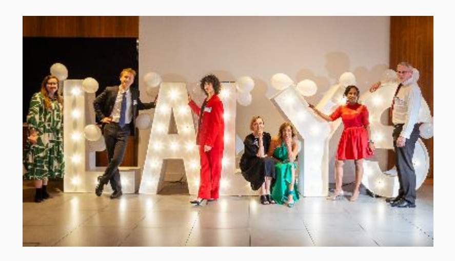
Copyright © 2023 Legal Aid Practitioners Group, All rights reserved.

Want to change how you receive these emails? You can update your preferences or unsubscribe from this list.