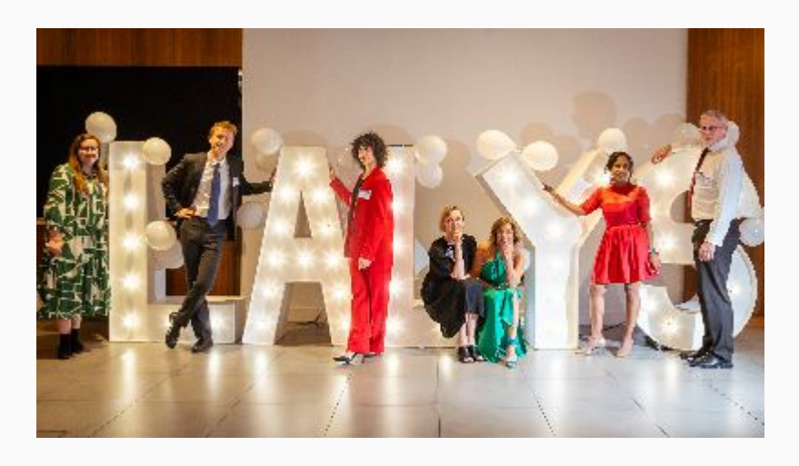
Copyright © 2023 Legal Aid Practitioners Group, All rights reserved.

Want to change how you receive these emails? You can update your preferences or unsubscribe from this list.