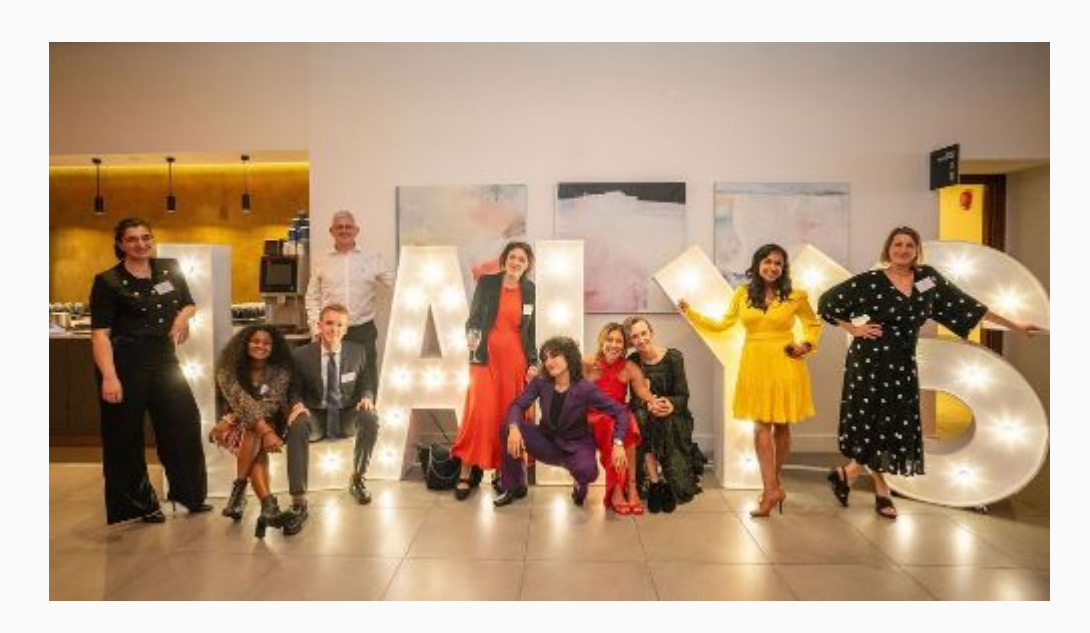
Copyright © 2025 Legal Aid Practitioners Group, All rights reserved.

Want to change how you receive these emails? You can <u>update your preferences</u> or <u>unsubscribe from this list.</u>