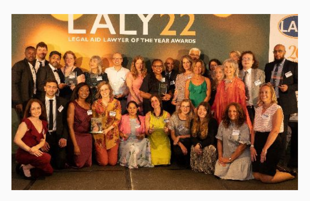
Copyright © 2023 Legal Aid Practitioners Group, All rights reserved.

Want to change how you receive these emails? You can <u>update your preferences</u> or <u>unsubscribe from this list</u>.