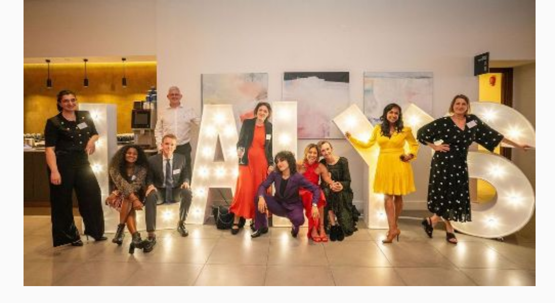
Copyright © 2025 Legal Aid Practitioners Group, All rights reserved.

Want to change how you receive these emails? You can update your preferences or unsubscribe from this list.